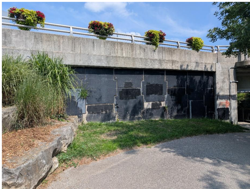
Figure 1: John St Bridge Abutment

The Town wishes to review options for the beautification of the bridge abutment. The bridge abutment faces into Balmoral Park. Balmoral Park is located in the downtown core and is considered the flagship of the Town's Park system. The Park is home to the Town's splashpad, healing garden, outdoor pool, playground, pavilion, and horticultural gardens. One suggestion has been to install a mural on the bridge abutment. This request for Expressions of Interest explores this opportunity.