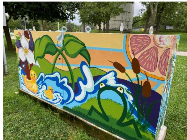
Figure 3 Utility Box